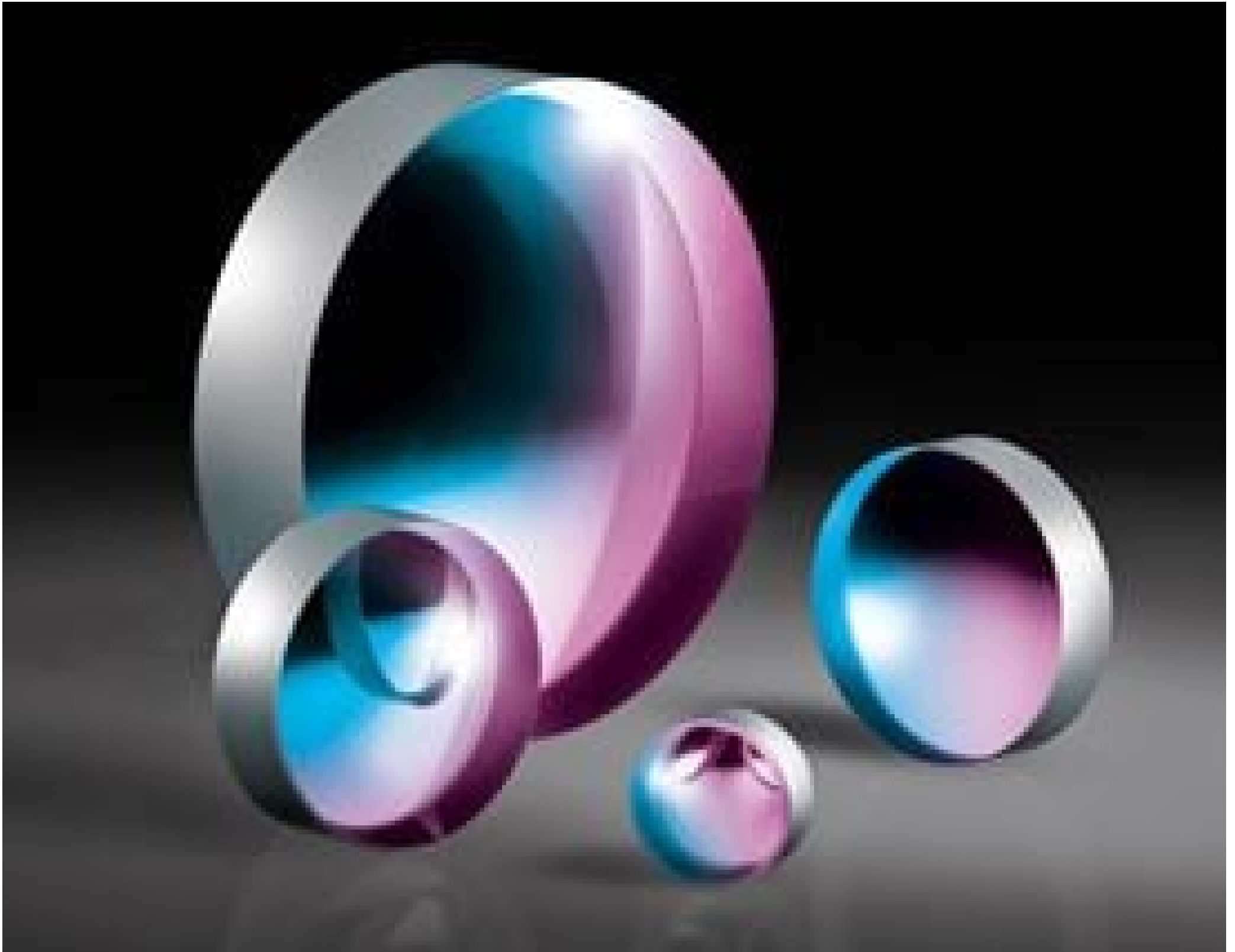
UV Fused Silica Plano-Concave (PCV) Lenses