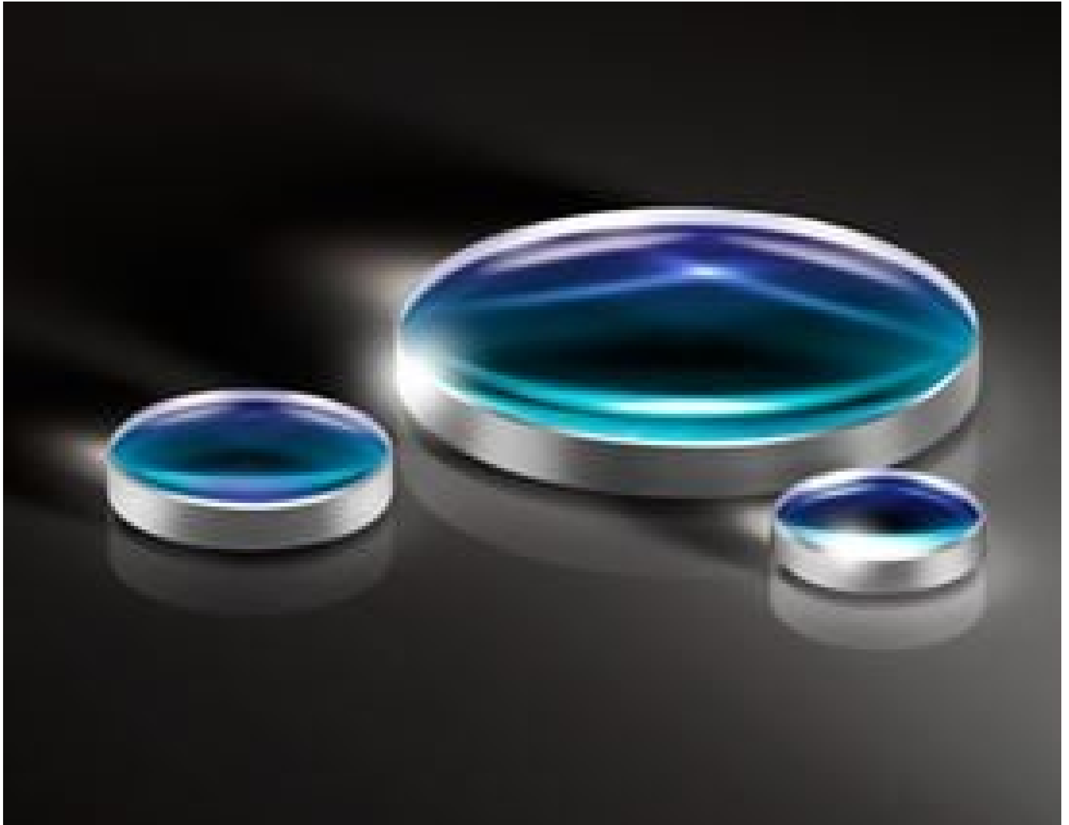
UV Fused Silica Double-Convex (DCX) Lenses